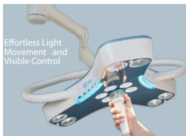
Effortless Light Movement and Visible Control